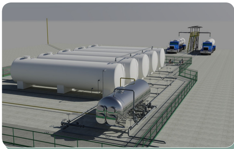
Fast Track Oil Production Facility