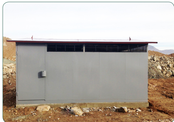
Manifold Safety Cabinet